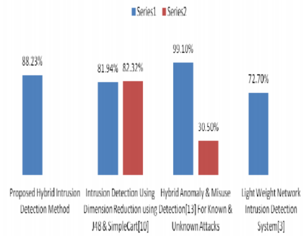
Figure 3. Comparative Analysis In Terms of Detection Accuracy

All the models represented in table 1. works on large number of parameters to detect the intrusions but the proposed hybrid model contains only 29 features to detect the attacks which is far less than the available models and total number of features in the data set. The new hybrid model where no training is required for intrusion detection and other bars are representing the comparison with the existing models, in mostly all the models previous training is required and model are successful only on already known attacks